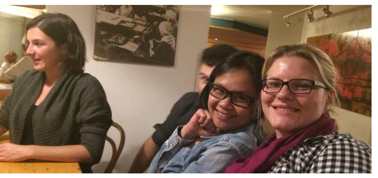
Figure 4: Get-together